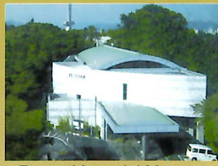
Peace Memorial Museum