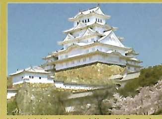
World Heritage Himeji Castle miraculously survived air raids