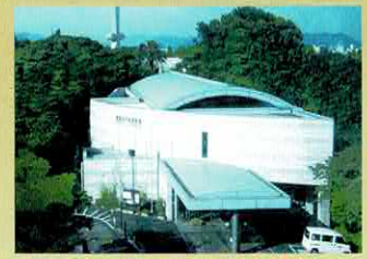
Peace Memorial Museum