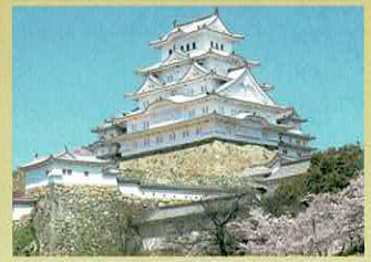
World Heritage Himeji Castle miraculously survived air raids