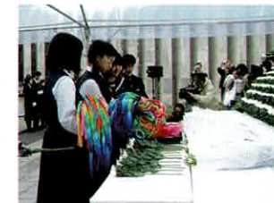
Peace Memorial Ceremony

Every year on October 26, the day when the memorial was completed, the Peace Memorial Ceremony is held to console the air-raid victims and pray for eternal peace by attendants from all over Japan including people from the member cities.