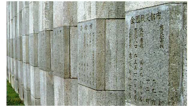
Perimeter Stone Columns

Today we are blessed to have a peaceful and prosperous society because of the sacrifice of war victims and the great efforts by previous generations.